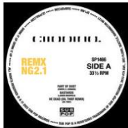
REMXNG 2.1 clipping.