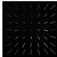
There Existed an Addiction to Blood clipping.