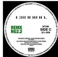
REMXNG 2.2 clipping.