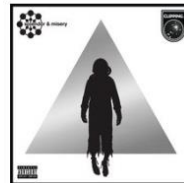
Splendor & Misery clipping.

This is the cover art for some of clipping's albums. As you can see, they are mostly black and white which is an element I would like to incorporate into my website.