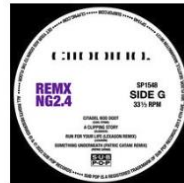
REMXNG 2.4 clipping.