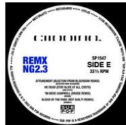
REMXNG 2.3 clipping.